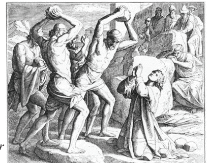
Saint Stephen, the First Martyr

Receive the Holy Ghost; whose sins you shall forgive, they are forgiven them; and whose sins you shall retain, they are retained. (John 20:22-23)